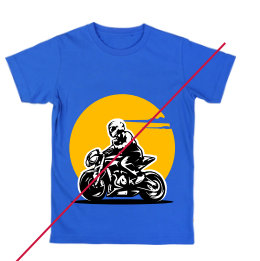
Distressed or graphic t-shirts are not permitted.