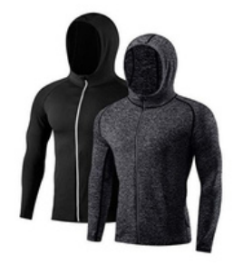
Athletic fitted hoodies and jackets with hoods