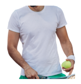
Men are permitted to wear athletic style, drifit tennis shirts but must have sleeves.