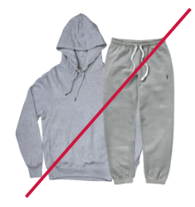
No bulky fleece/hoodie sweatshirts or sweatpants