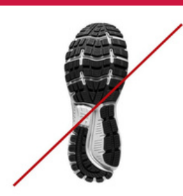
Cross trainers and running shoes