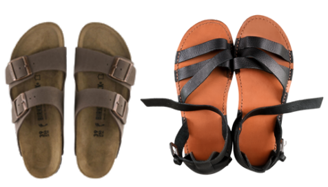
Sandals and opened toed shoes