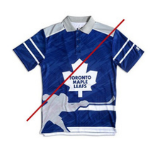
Commercial designation logos ie. sports teams, personal business